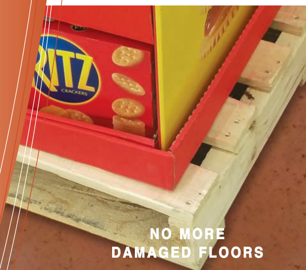
NO MORE DAMAGED FLOORS

MAKING STANDARD WOOD PALLETS POP FRIENDLY