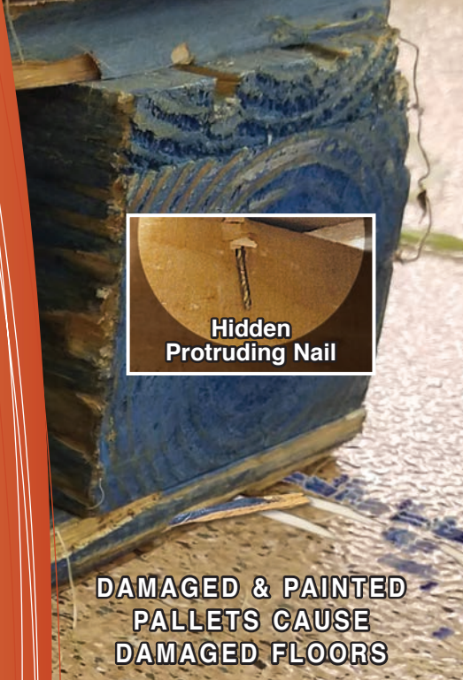
DAMAGED & PAINTED PALLETS CAUSE DAMAGED FLOORS

If you or your vendors would like a FREE sample, please contact us at 1-800-425-4778, or email us at samples@clipstrip.com and ask for the PFP-3.