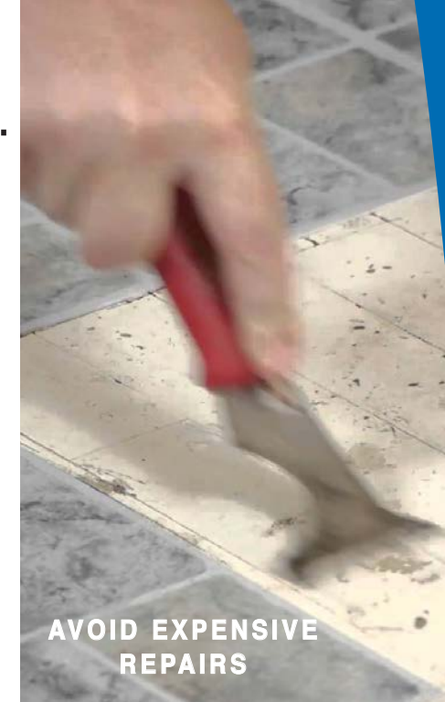
AVOID EXPENSIVE REPAIRS

Would you like to prevent this from happening? Of course you do. Our Pallet Floor Protector (PFP-3), saves money, saves time, protects floors and there should be no cost to you, the retailer. The PFP-3 will increase the Life-Cycle and Appearance Retention of your floors.