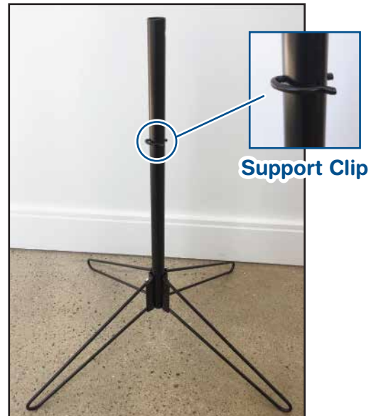
Feet Attached to Base Pole

Step 2: Joining together the three labeled racks marked, Top, Middle and Bottom. (see next page).