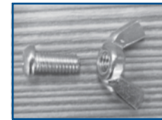
Screw & Wing Nut